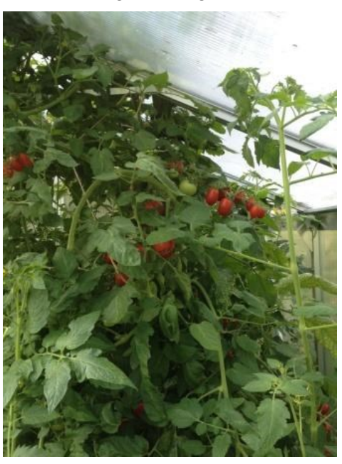
In autumn: ripe tomatoes in greenhouse Rebus (2013)