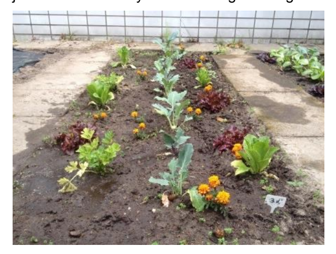
Newly planted patches at Schleemer Park

As these administrative barriers took some precious time, we could not start establishing the greenhouses before Mid-June, only a short time before the start of the summer holidays. We finished the greenhouse at Rebus at the end of June and the one at Schleemer Park in late July, just in time for this years second gardening season.