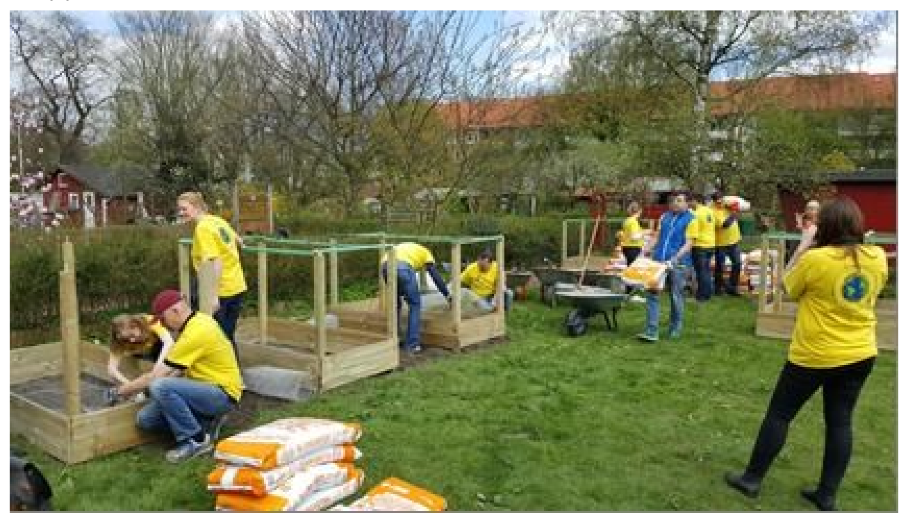
Team of General Mills Hamburg on Earth Day, creating the new garden at Wichern School (2016)

Additionally, with the assistance of the team of General Mills Hamburg, we created a new garden every year.