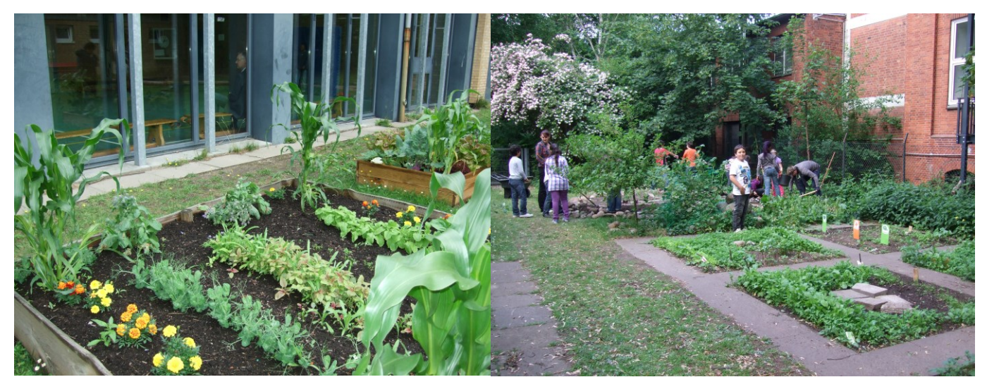
Garden at School Weddestrasse ...

Thanks to the donation of the General Mills Foundation we also re-started in 2011 the gardening projects at School Weddestrasse and Fritz Köhne School. In both schools we had Gardens for Children in the previous years 2007-2009 during our project "Bille in Movement" ("Bille in Bewegung") and children and teachers at both schools were very happy about the re-start.