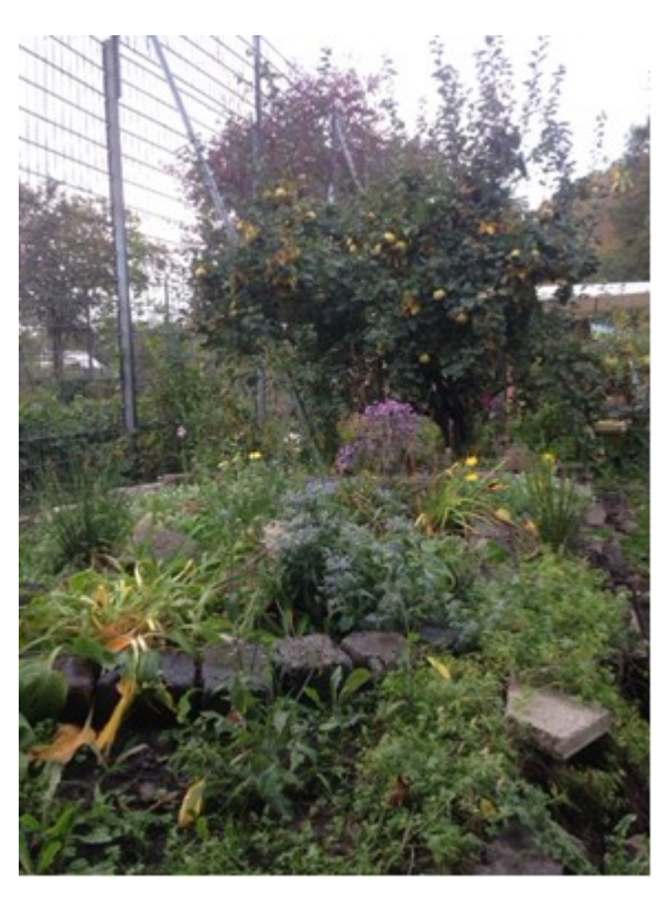
Garden at Wichern School after some months

Our gardening class started late April with only five students, but at the end of May up to 20 decided to spend their afternoon classes in our garden, who cultivated the patches with big enthusiasm. The patches were cultivated with vegetables, herbs and flowers.