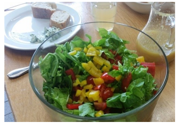
After the harvest: Healthy meal with salad