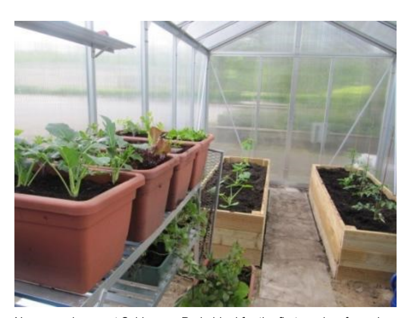
New greenhouse at Schleemer Park: ideal for the first weeks of growing

The school Schleemer Park is a regular elementary school. The average class size is 20 students. During our regular period of the "Bille in Bewegung" - project (2007 – 2009) there had been cultivated 14 patches, which where looked after once a week by two classes. During the following three years all these patches lay waste, as the responsible teacher retired in early 2010. All the teachers were absolutely enthusiastic about our offer to take care of their garden again.