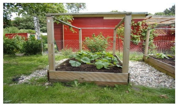
... and at Wichern School