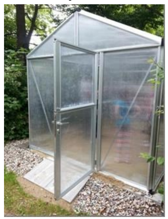
New greenhouse at Hauskoppelstieg (Spring 2014)

In early 2014, our school Weddestrasse moved into a new building as it was united with the school Hauskoppelstieg. The school Hauskoppelstieg is a "special school", where slow learners and children with behavioral disorders are looked after. For these children all forms of practical instructions are a big enrichment, as most of them have severe problems with theoretical lessons.