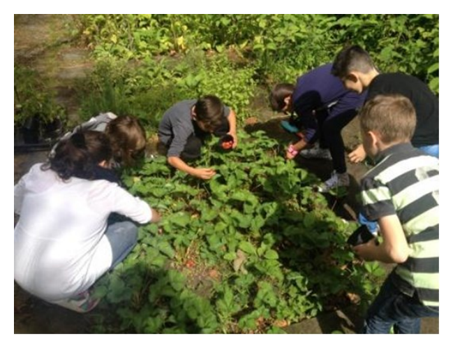
Harvest of strawberries (2014)

Since its beginning in 2011, our garden project promotes nutrition and creates an awareness of the origin of our food and biological coherences to the youngest members of our community. Project location is the area of East Hamburg as it is a social hotspot within our community. The garden project adresses social disadvantaged children aged 6 to 10 years at elementary schools of Hamburgs east. In general, in their families exists nearly no knowledge about healthy food.