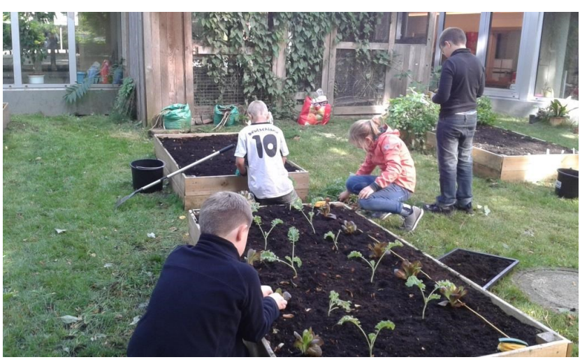
Patches at Brüder Grimm School (Spring 2015)

After three years the teachers of Brüder Grimm School were able to take over the gardening project to continue in their own responsibility.