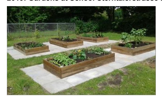
Patches at Sterntalerstrasse ...