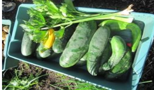
Patches with vegetables and flowers at Rebus, spring 2011