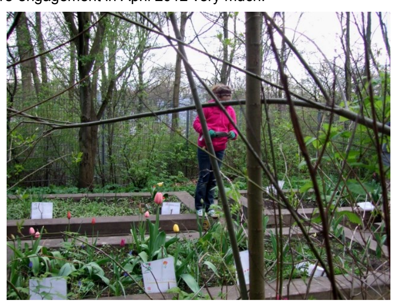
Patches at Steinbeker Marktstrasse

After the end of the regular project period in 2009 the patches at Steinbeker Marktstrasse were cultivated by several teachers and garden groups. However, only flowers were planted as no teacher at this time had the expert knowledge of vegetable gardening. The school appreciated our re-engagement in April 2012 very much.