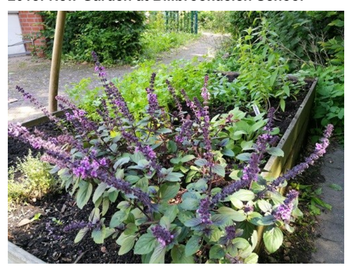
Herbs at Billbrookdeich School

In 2018 we started a new garden at Billbrookdeich, a regular primary school with a big unused enclosed garden.