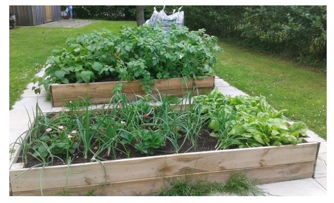
Patches at School Sterntalerstrasse

The school planned to offer an open gardening course once a week for any student who is interested in spending their afternoon hours in that garden.